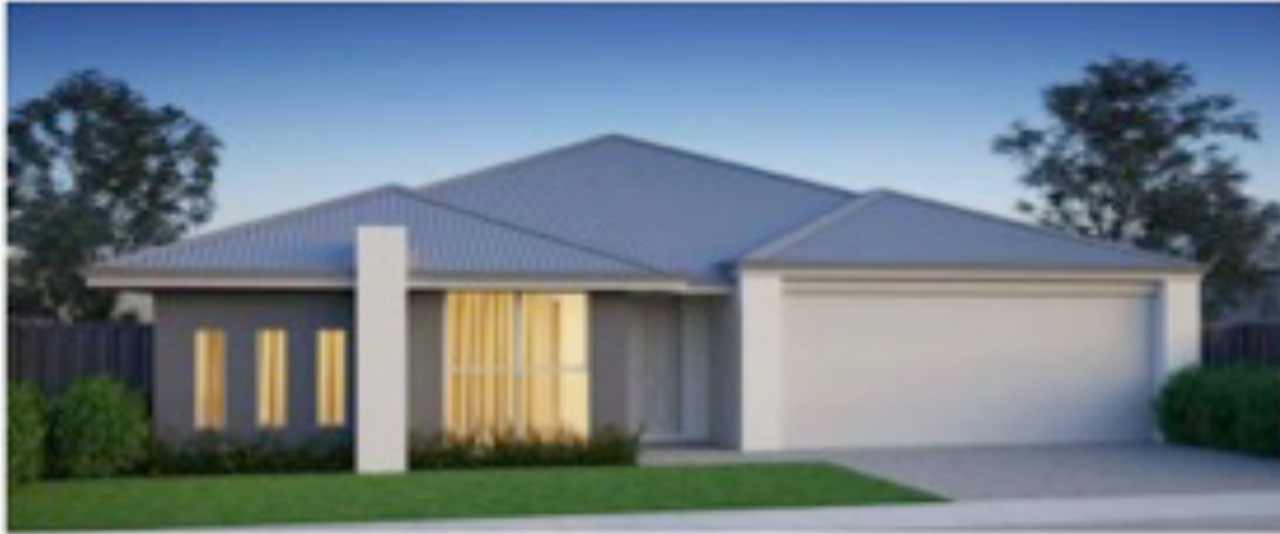
The St Kilda Beach Included