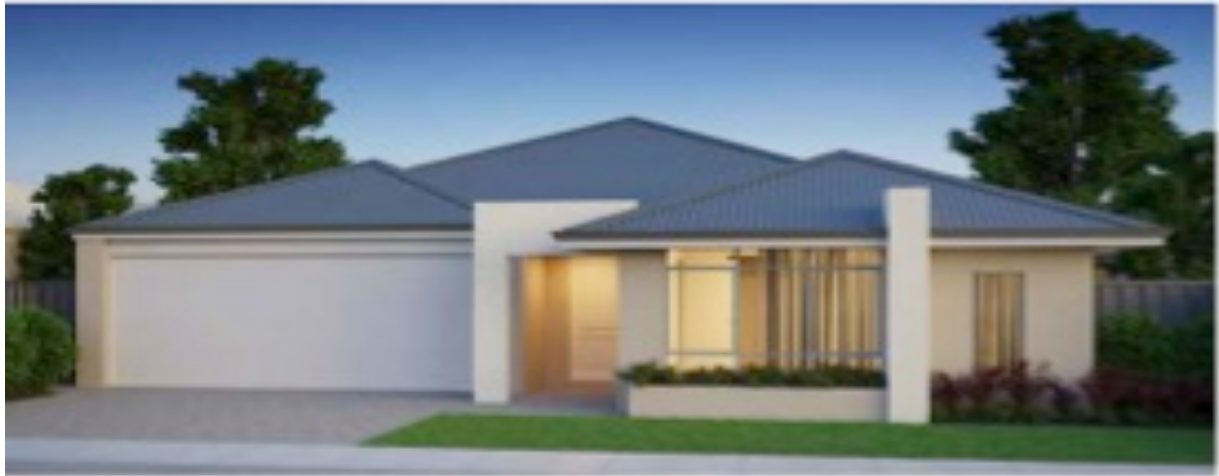
The Torquay Beach Included